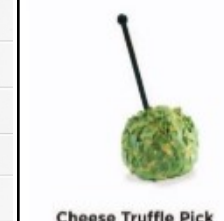
Cheese Truffle Pick Cold Pack Cheese, Dried Chives