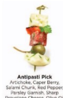
Antipasti Pick Artichoke, Caper Berry, Salami Chunk, Red Pepper, Parsley Garnish, Sharp Provolone Cheese, Olive Oil