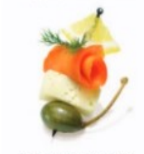
Smorg-More Pick Caper Berry, Dill Havarti Cheese, Lox/Cured Salmon, Baby Dill, Lemon Wedge Garnish