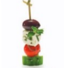
Greek Salad Pick Cucumber Chunk, Grape Tomato, Feta Cheese Cube, Pitted Kalamata, Olive Oil Drizzle, Oregano Garnish