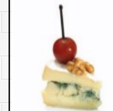
Torte Pick Camembert Cheese, Gorgonzola Cheese, Walnut, Red Grape