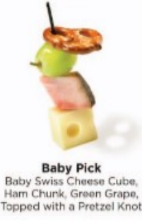
Baby Pick Baby Swiss Cheese Cube, Ham Chunk, Green Grape, Topped with a Pretzel Knot