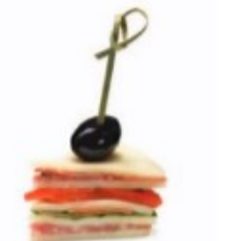
Rustica Pick Mild Provolone Cheese, Salami, Pepperoni, Basil, Roasted Red Pepper, Pitted Kalamata Garnish