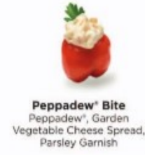
Peppadew® Bite Peppadew®, Garden Vegetable Cheese Spread, Parsley Garnish