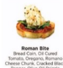
Roman Bite Bread Coin, Oil Cured Tomato, Oregano, Romano Cheese Chunk, Cracked Black Pepper, Olive Oil Drizzle