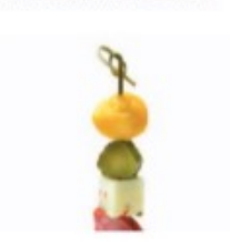
Deli Pick Sausage, Pepper Jack Cheese, Sweet Pickle, Cheddar Cheese Curd or Cube