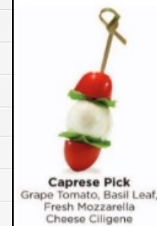
Caprese Pick Grape Tomato, Basil Leaf, Fresh Mozzarella Cheese Ciligene