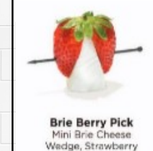
Brie Berry Pick Mini Brie Cheese Wedge, Strawberry